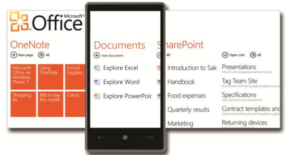
The Office Hub for Windows Phone for anywhere access to documents

That is why we recommend Microsoft® Office 365 for your business. Office 365 brings together Office 2010 with cloud-based shared documents, instant messaging, web conferencing, and the power of Exchange Online, the industry’s leading business-class email with 25GB mailboxes and built-in layers of antivirus and anti-spam protection. So why should you care?